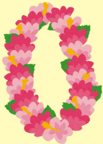
An image of a pink lei.

To RSVP or request reasonable accommodations, e-mail rsvp@swcil.com or call 507-532-2221 ext. 111 (For MN Relay, dial 711)